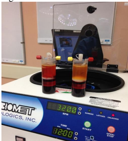
Figure 2: Bone marrow concentration

Bone marrow aspiration is performed using a specific needle. Once this sample is obtained, a special machine is used to centrifuge the sample.