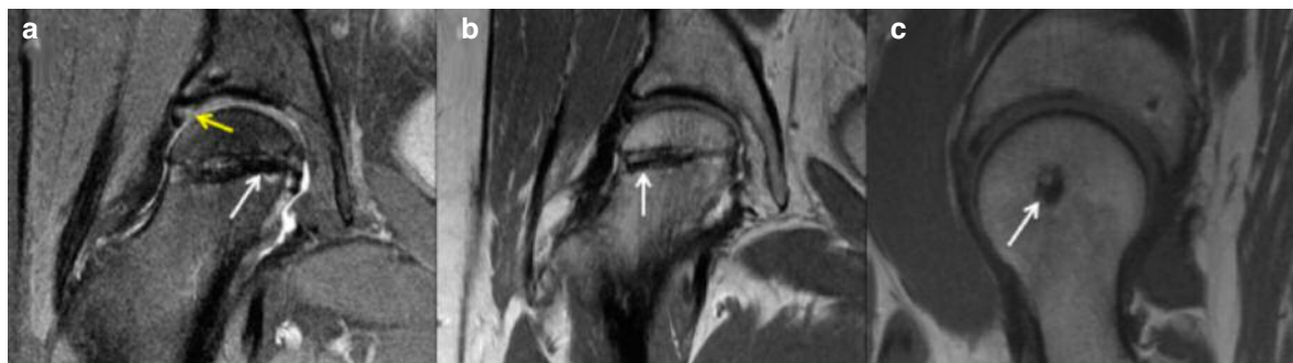
Figure 2 a-c. (a) Postoperative T2 coronal magnetic resonance imaging (MRI) of the right hip showing the ligamentum teres (LT) graft within the tunnel (white arrow). Signal intensity is seen in the chondrolabral junction (yellow arrow), indicating healing response after labral repair. (b) Postoperative T1 coronal MRI showing a well-seated biotenodesis screw (4.75 × 15 mm, Arthrex) within the femoral head (white arrow), securing the LT graft. (c) Postoperative T1 sagittal MRI showing centrally positioned graft tunnel (white arrow).

In general, there are two cohorts of patients treated for tears of the ligamentum teres. The first group is the patient with FAI or hip osteoarthritis with chronic LT tendinopathy or a partial LT tear in which simple debridement is indicated. The second group includes patients with hip instability who are more likely to experience a complete tear of the LT. In these patients, LT reconstruction is reserved for cases when an osteotomy procedure to correct the hip dysplasia is not indicated. The literature on surgical management of LT tendinopathy is limited and mainly includes case